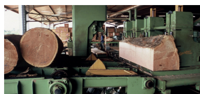
Mbouma and Mevang Sawmills, GABON

From its annual production of around 500,000 cbm/year of FSC® certified logs, Rougier Gabon secures the supply of 413,000 cbm/year of FSC® certified logs to its main local partners.