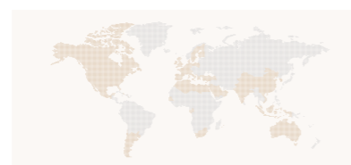
A worldwide presence

Rougier Afrique International markets around the world, logs, sawn timber, plywood, veneers and laminated timber coming exclusively from sustainably managed african forest.