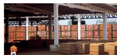
Mouale Sawmill, CONGO

Each year, Rougier Congo produces around 100,000 cbm of Legal Source (LS®) certified logs and 40,000 cbm of (LS®) sawn timber.